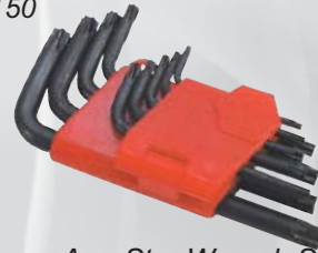
T73089 9pc Long Arm Star Wrench Set • Sizes: T10, T15, T20, T25, T27, T30, T40, T45, T50