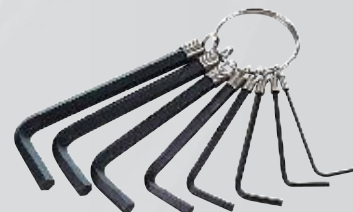
T73071 8pc Metric 1.5, 2, 2.5, 3, 4, 5, 5.5, 6mm