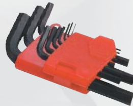
T73016 10pc Metric 1.27, 1.5, 2, 2.5, 3, 4, 5, 6, 8, 10mm