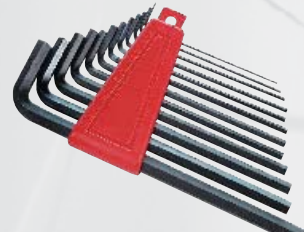
T73004 9pc Metric 1.5, 2, 2.5, 3, 4, 5, 6, 8, 10mm