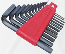
T73001 9pc Metric 1.5, 2, 2.5, 3, 4, 5, 6, 8, 10mm