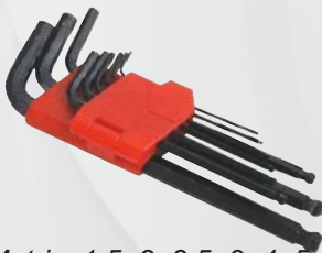
T73041 9pc Metric: 1.5, 2, 2.5, 3, 4, 5, 6, 8, 10mm