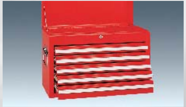
T47053 5-Drawer Tool Chest