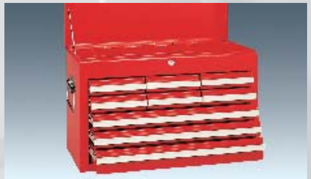
T47055 9-Drawer Tool Chest