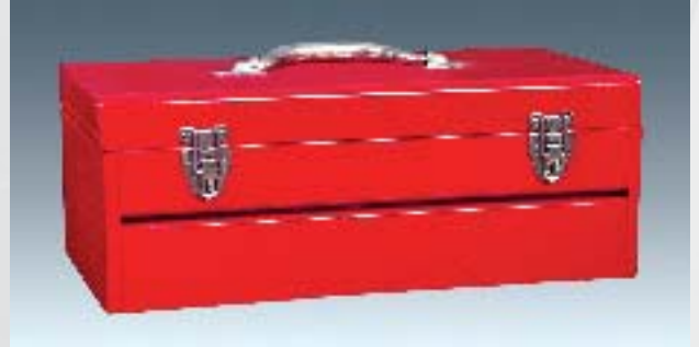
T47003 Tool Box (435 x 195 x 183mm)