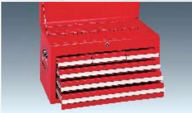
T47054 6-Drawer Tool Chest