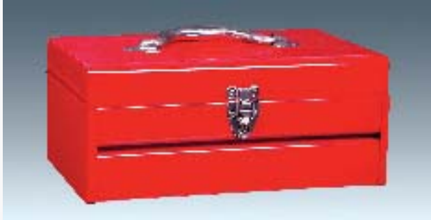
T47002 Tool Box (350 x 195 x 155mm)