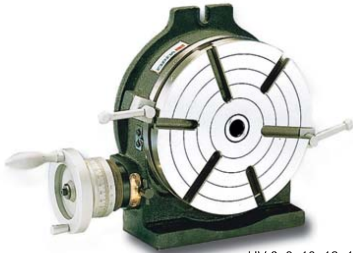
HV-6, 8, 10, 12, 14, 16