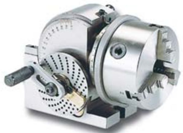
The state of BS-0 fitted with 5" 3-Jaw Chuck