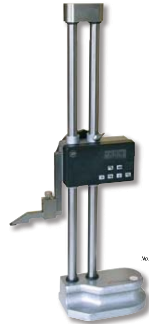
No. 1807 101

Verstellung durch Handrad. Adjustment by hand wheel.