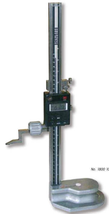
No. 1800 101s